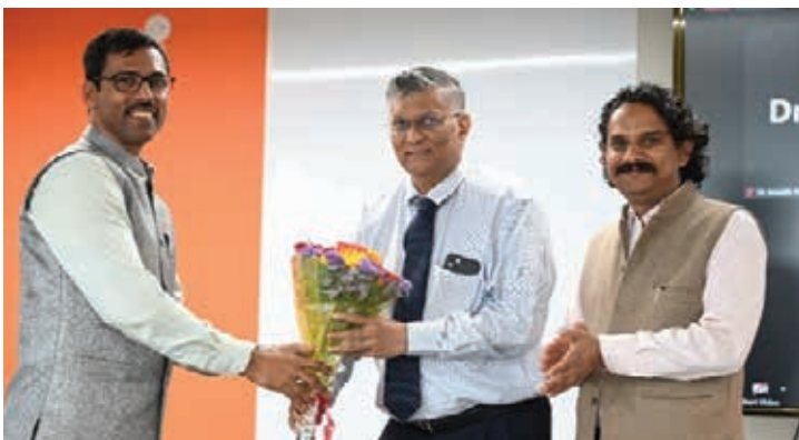
Digital Society Day | Industry-Academia Roundtable Discussion on Cybercrime | 17th Oct 2023