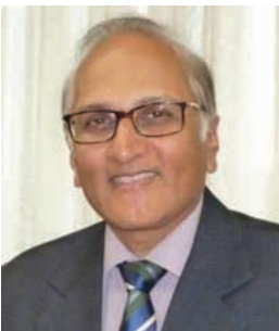
Hon'ble Justice S Ravindra Bhat Former Judge Supreme Court of India