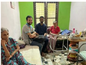
Aradhana Old Age Home and Care Takers- Ambalapadi