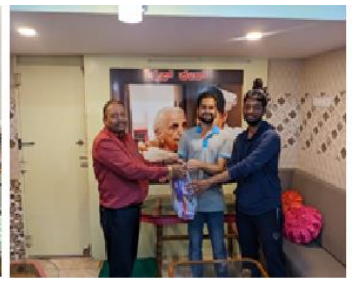
Life Care Old Age Home- Uppur