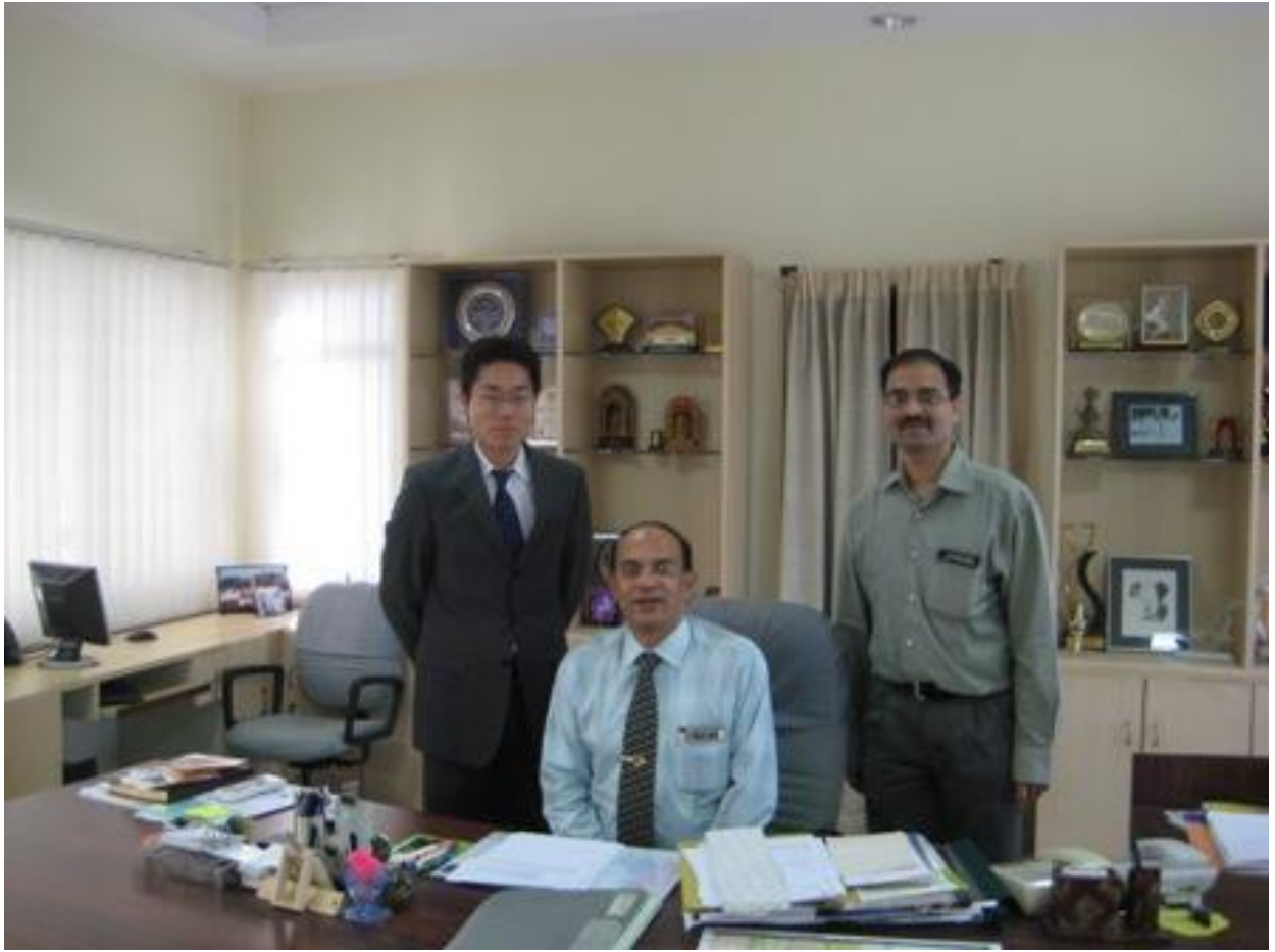
Japanese traveling fellow visited Department for visiting fellowship of Japanese Pediatric Orthopaedics society.